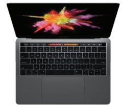
Mac or PC